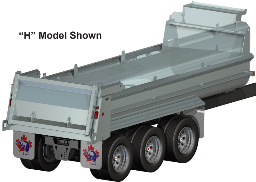
"H" Model Shown