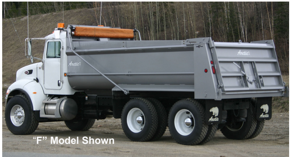
"F" Model Shown